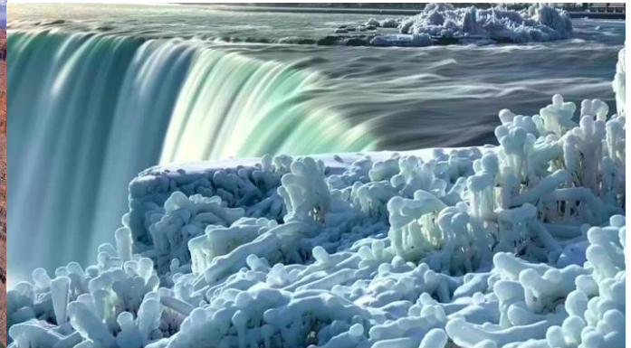
Top left: Rocky Mountains; Top right: The Panama Canal; Bottom left: Grand Canyon; Bottom right: Niagara Falls